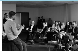
Initiative sharing & Information corner, room C3

13.30 - 15.00 Knowledge Stock Exchange (KSE)