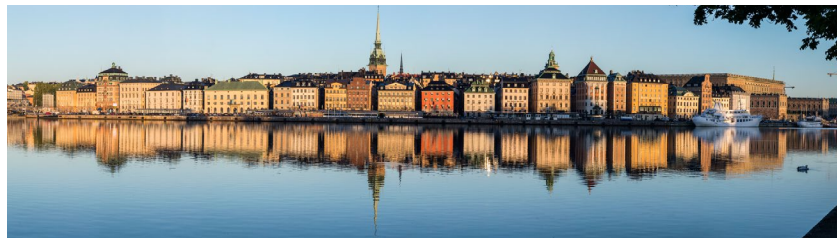
Join us for a walk in Stockholm

The guided tour starts with a short introduction of the city center. After 30 minutes, we will arrive at city district Gamla stan, one of the best preserved districts in the city. In just one hour you will learn: how many rooms the Royal Palace has, what the statue of Saint George and the Dragon really means to Swedes, why the Old Town is bigger today than when it was first founded, where the narrowest alley in the Old Town is, what the Swedes used to put in their beer, and so on. In short: With our stories, legends and humor, we make the Old Town come alive. After this tour, our tour guide will take you by metro to the welcome reception at Stockholm University.