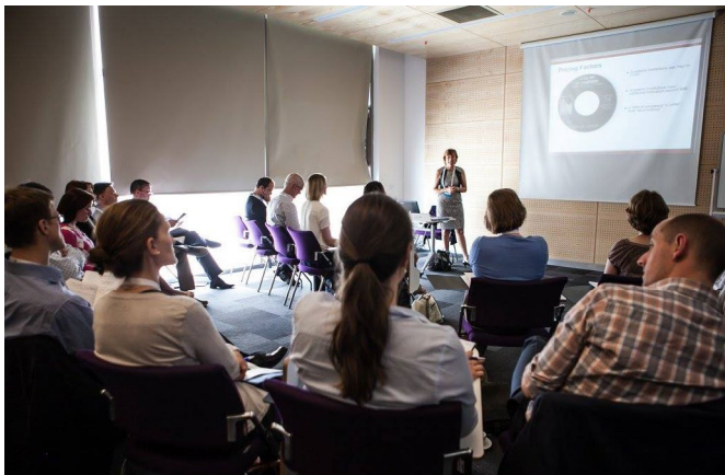
Impression of a previous masterclass

At the end of this masterclass, these new knowledge, tools and skills will help TT professionals move away from cost leadership, where IP is seen as a legal cost, and encourage value leadership, where IP supports value capture/creation.