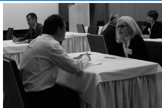
Face-to-face meeting, room C4

The Knowledge Stock Exchange (KSE) is divided in micro-sessions of 15 minutes. You can move from one room to another, every 15 minutes.